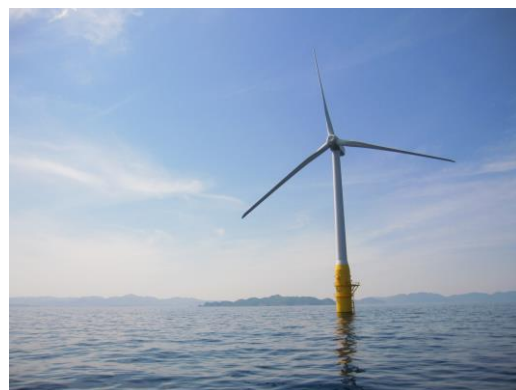
Floating-type offshore wind turbine in Goto city